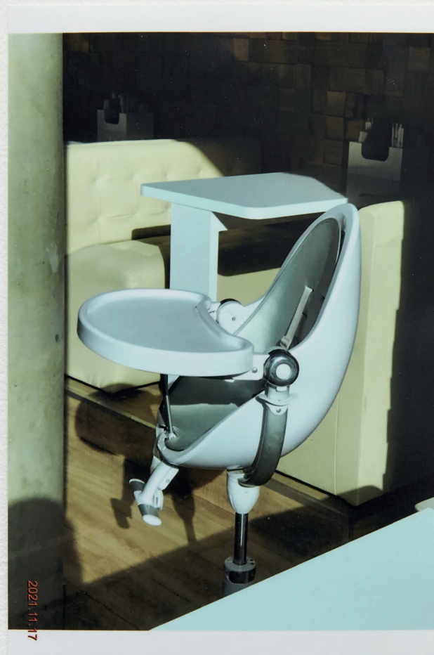
Highchair , 2020 wetlab print 15.2 x 10.1cm Flowers , w/ Max Petts, Xxijra Hii, London