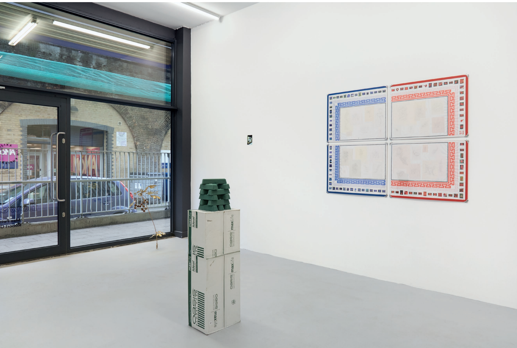
Flowers , 2022 w/ Max Petts installation view Xxijra Hii, London