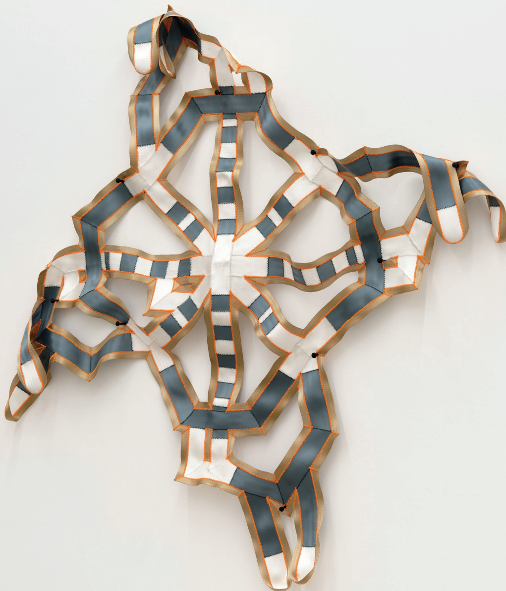
Window of Tolerance , 2022 polyester seatbelt webbing, cotton, forged iron 180 x 210cm Nerve Net , w Jazbo Gross, Calcio, London