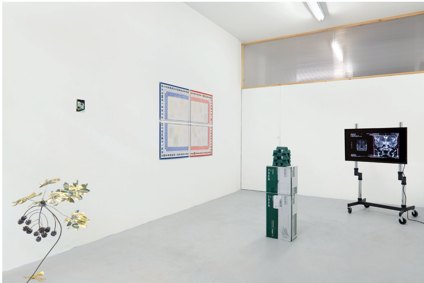
Flowers , 2022 w/ Max Petts installation view Xxijra Hii, London