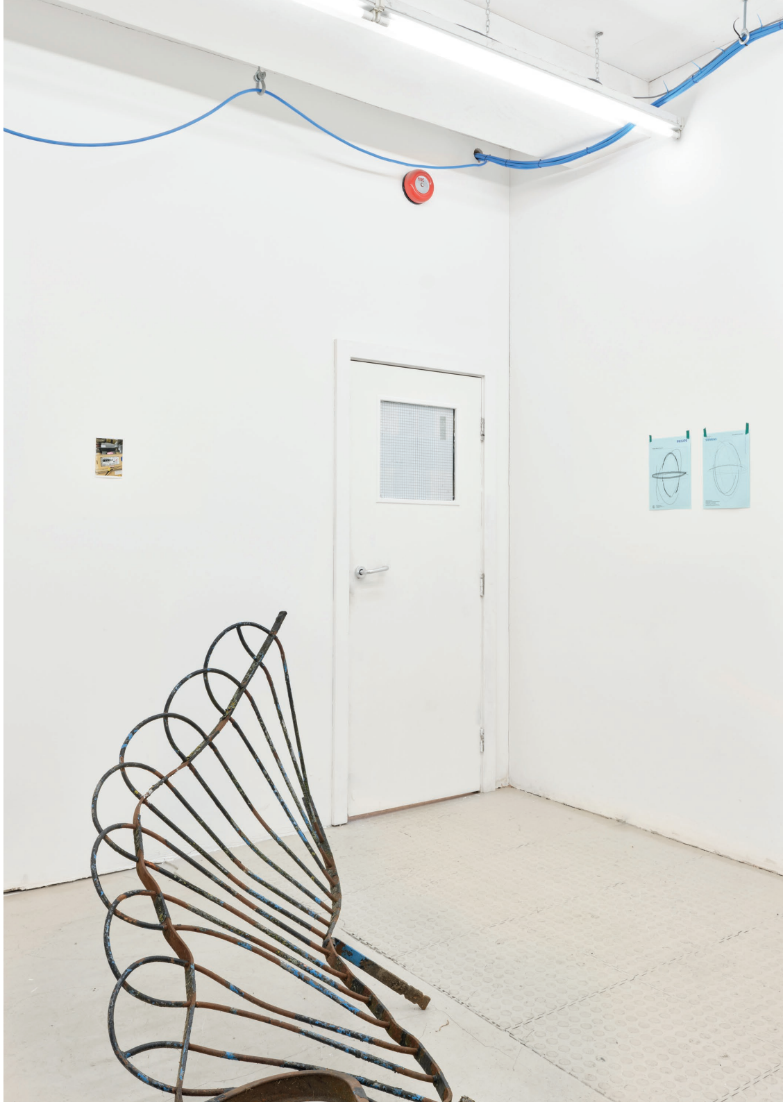
Nerve Net , 2023 w/ Jazbo Gross Installation view Calcio, London, 2023