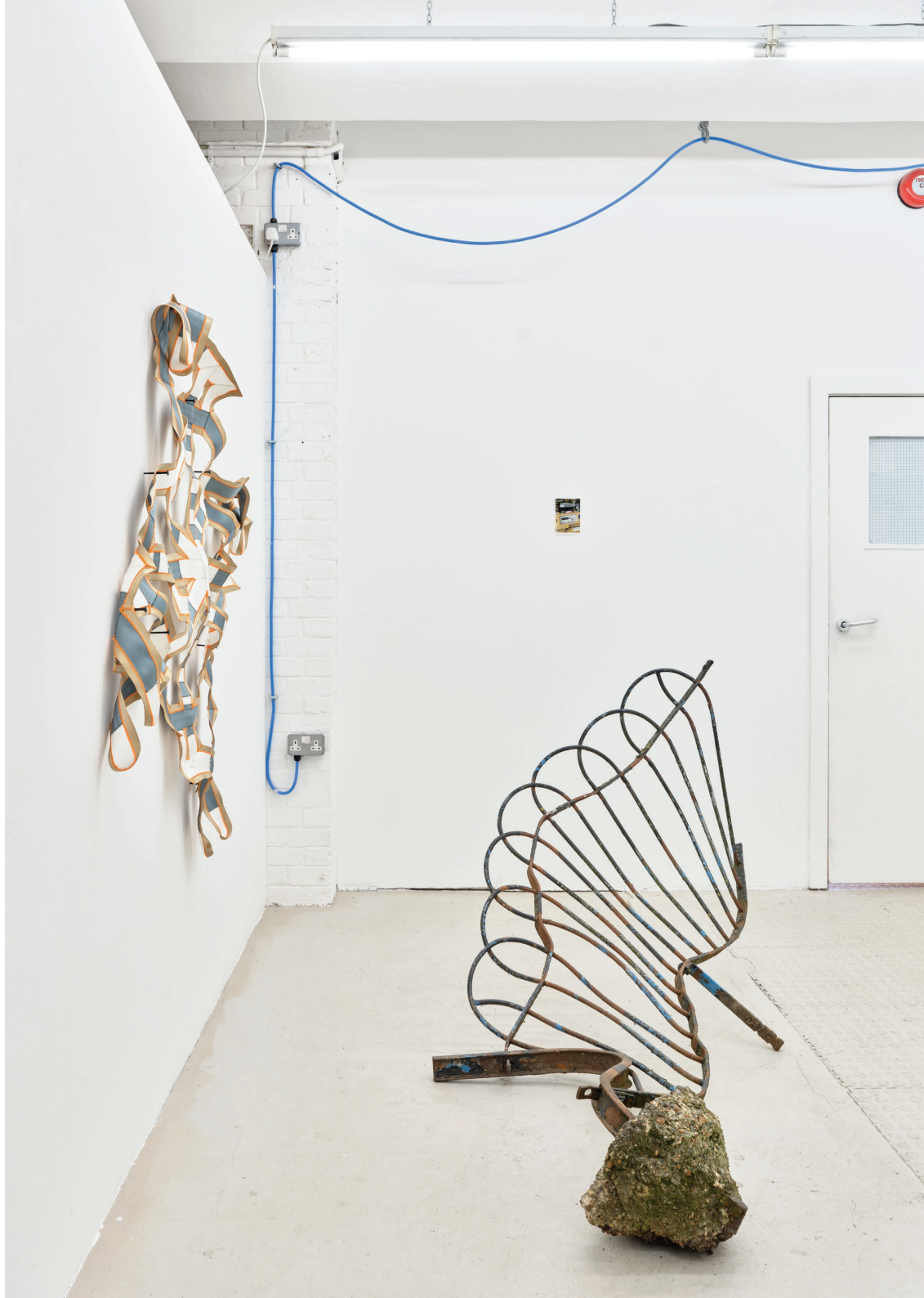
Nerve Net , 2023 w/ Jazbo Gross Installation view Calcio, London, 2023