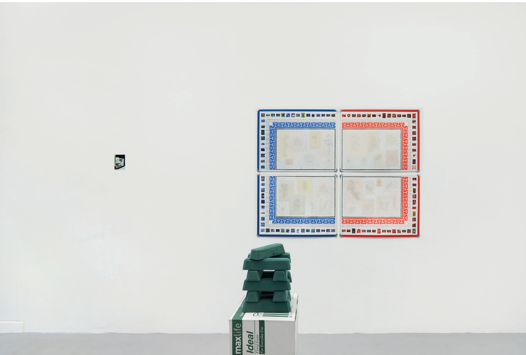
Flowers , 2022 w/ Max Petts installation view Xxijra Hii, London